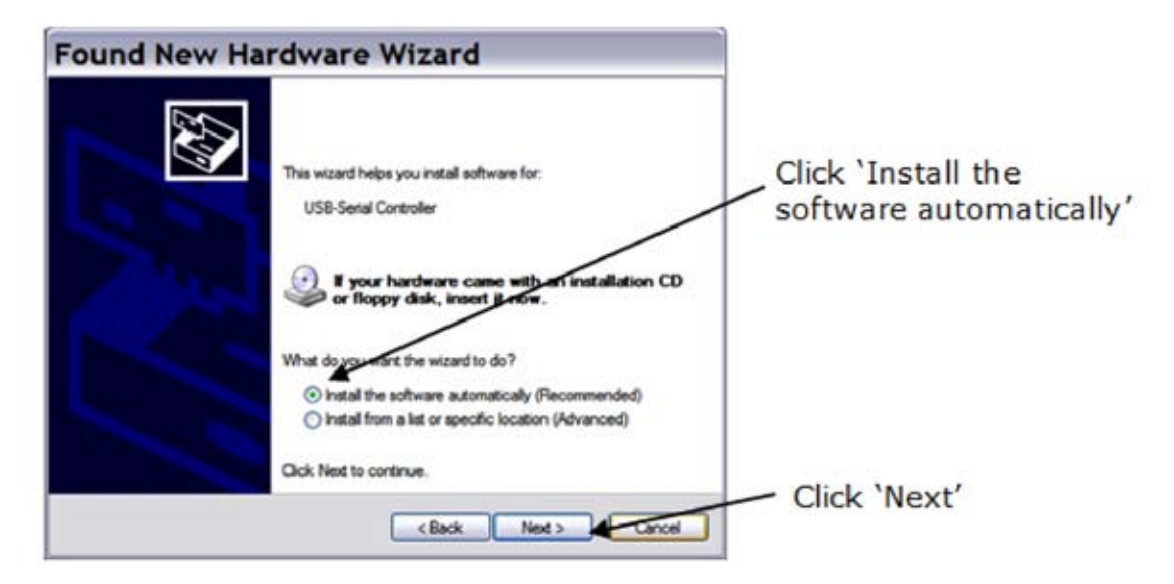
Figure 9. Installing drivers for cables