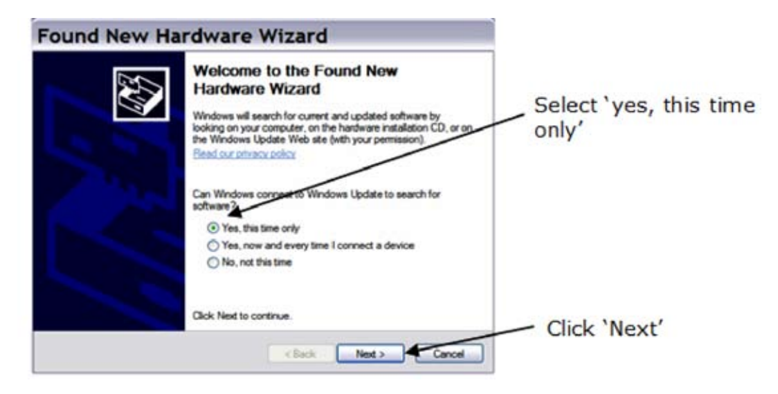
Figure 8. Installing drivers for cables